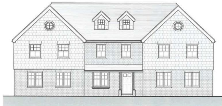
1. Proposed South Elevation 1:100 @ A3

All three proposed properties comprising four bedrooms and two bathrooms over three floors.