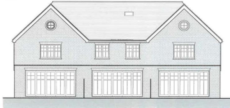
3. Proposed North Elevation 1:100 @ A3