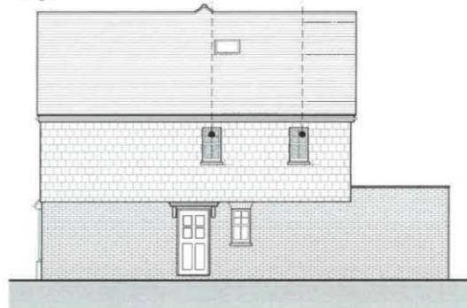
4. Proposed East Elevation 1:100 @ A3